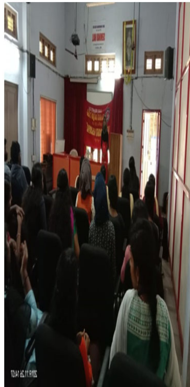
AIDS DAY POSTER MAKING